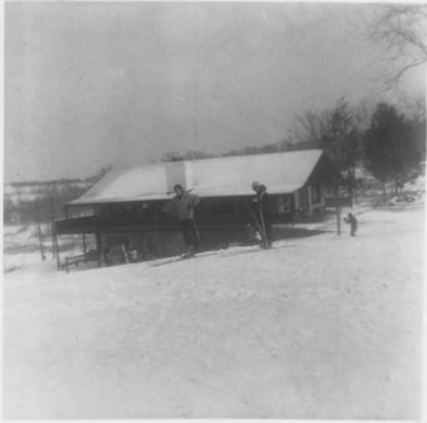
The lodge.