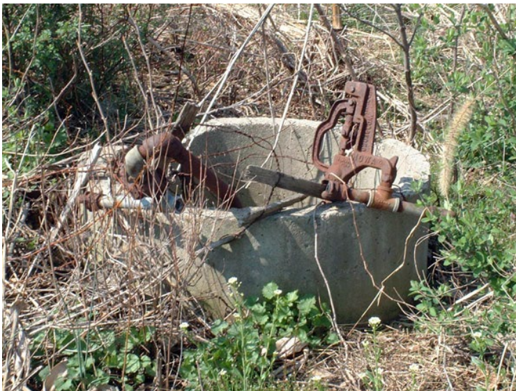
Remnants of snowmaking.