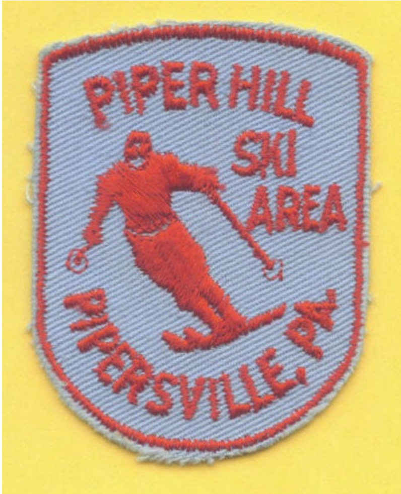
A patch from Piper Hill Ski Area.

Woody Bousquet uncovered a ski patch that indicates there was a ski area named "Piper Hill" in Pipersville, PA at some point.