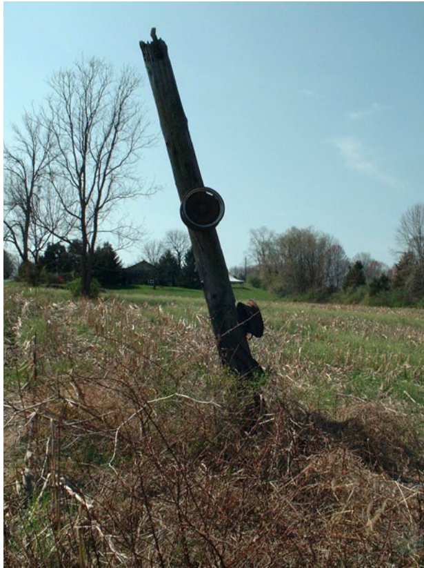
Bottom of a rope tow. Photo