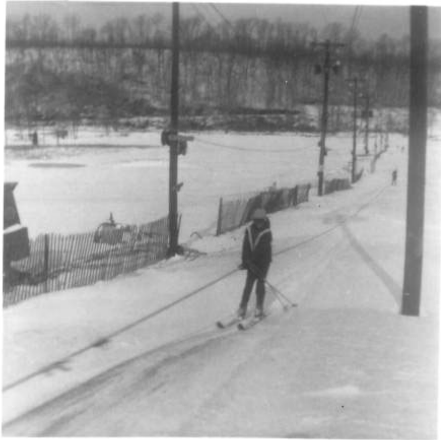
The rope tow.