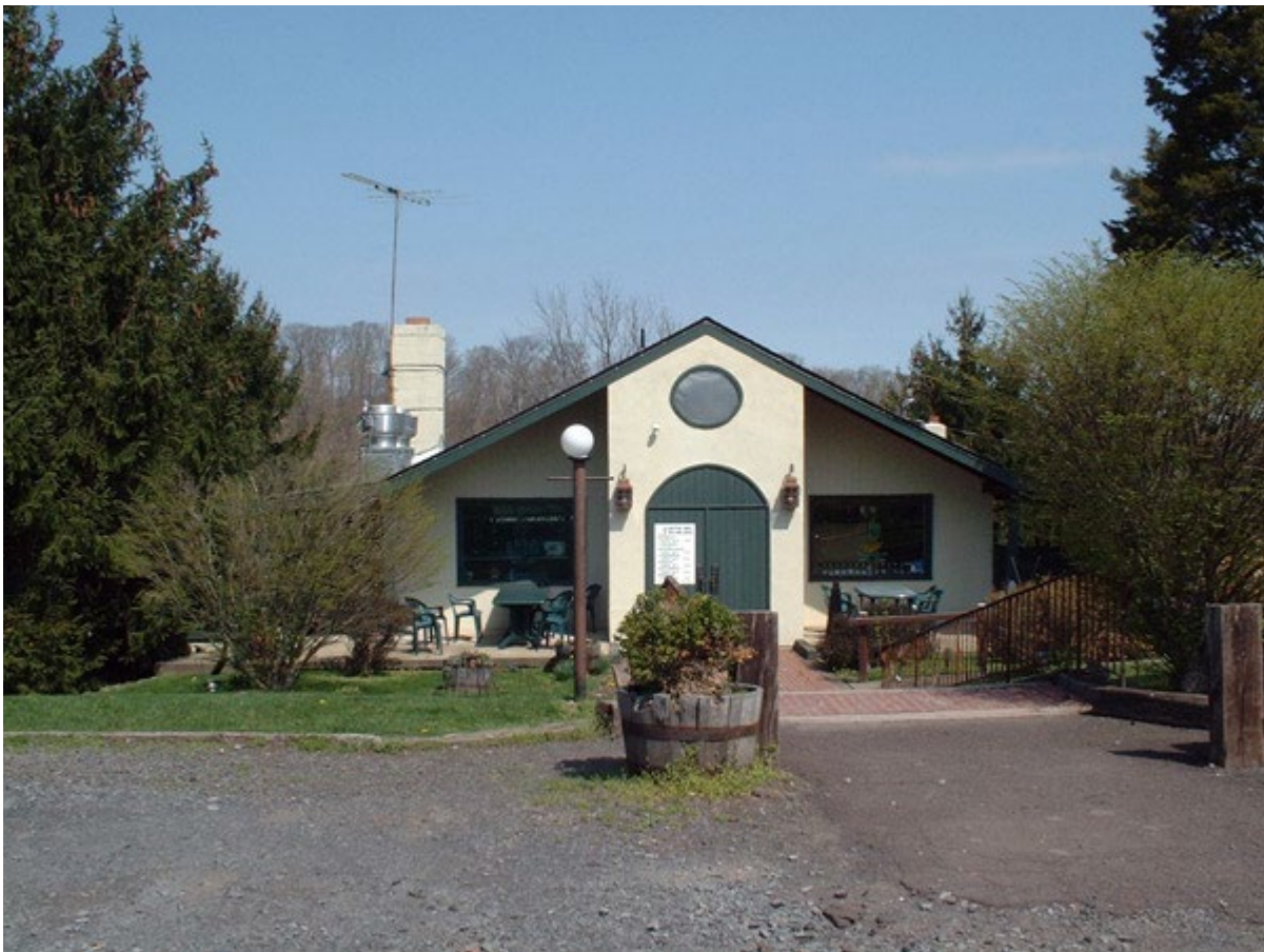
Main entrance to the lodge.