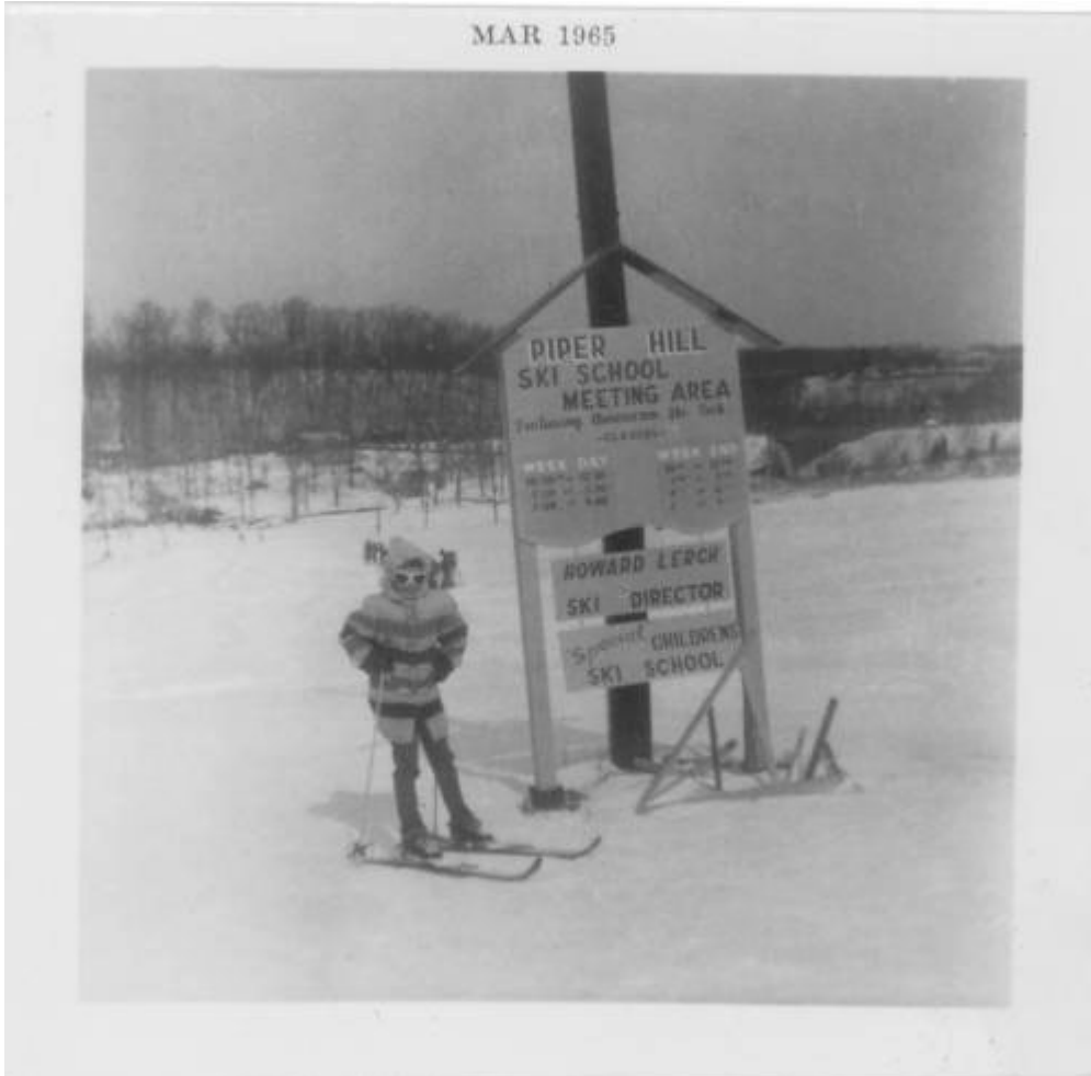
Ski school meeting place.