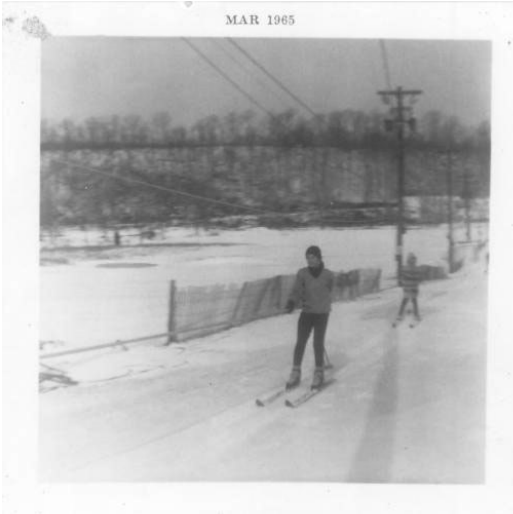
The rope tow.